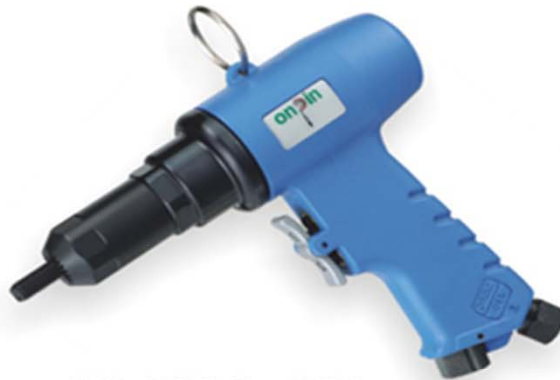
OP-PS10-G51 Side exhaust 側排氣